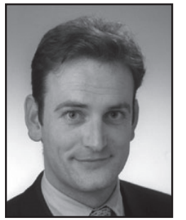
Douglas Carswell MP Conservative